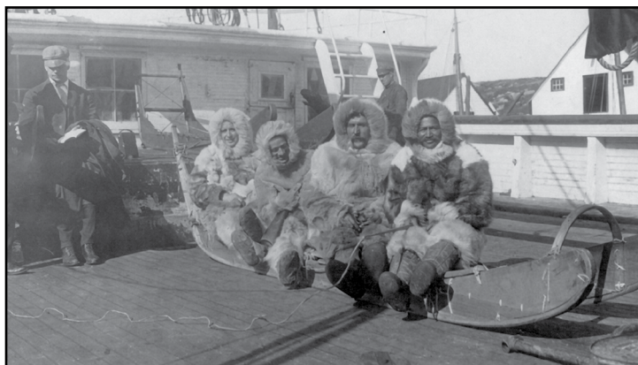
Henson (right) and some of the crew relax on a sledge aboard a ship