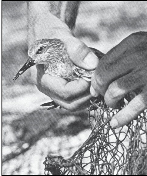
A worker frees a knot from a cannon net.