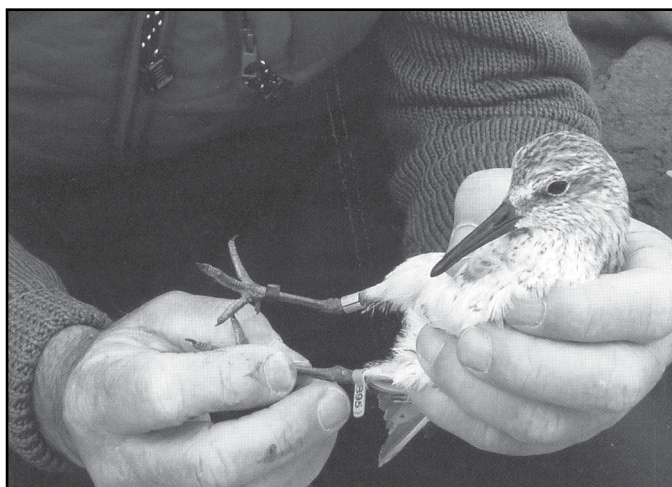
B95, as he appeared in his gray nonbreeding plumage at Rio Grande, November 8, 2007